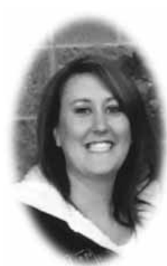
Uintah Basin Graduation Speaker (Uintah Basin Regional Campus)