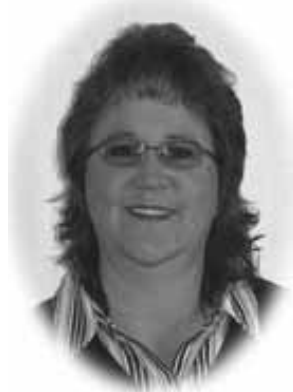
Tooele Regional Campus