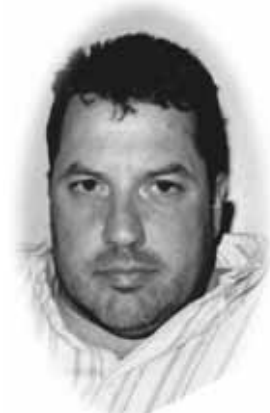
Kaysville Regional Campus