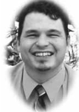
Uintah Basin Regional Campus