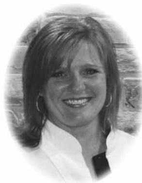
MSW Student of the Year 2011