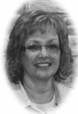
Brigham City Regional Campus